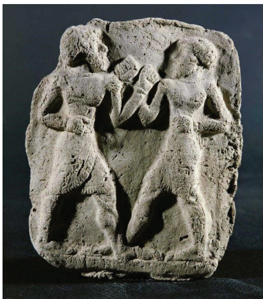
Figure 1. Depiction of ancient boxing on Mesopotamian Terracotta relief (Circa 2000 B.C.E.)

BCE (No. 9012). In the third register, two boxers and two musicians are seen. With the exception of gloves and cache-sex, both boxers are nude. They adopt positions that are reminiscent of modern boxing matches (Mohamed, 2020). There are various interpretations of the depictions of the delicate fragment of terracotta relief that was found in the Nintu temple in “Khafaji” and dates to the early Sumerian dynastic eras, roughly 3000–2340 BCE. The right of this tableau depicts two sportsmen facing one another and holding each other by the arms, similar to the preceding limestone plaque. The athlete on the left in the main picture looks to have been knocked off by his opponent by grabbing his leg, and he is now tumbling to the ground. According to investigator Murry, the two people on the right are boxers (Festuccia, 2016; Murray, 2010). Another ancient Babylonian-era terracotta tablet was discovered in a tomb near Larasa in southern Iraq (2000–1595 BCE). On this tablet, two men were playing boxing while dressed in hats and tunics. The boxers are using bare hands. Surprisingly, two musicians playing instruments demonstrated that ancient boxing games from the ancient Near East, like bull leaping, were accompanied by music (Mohamed, 2020).