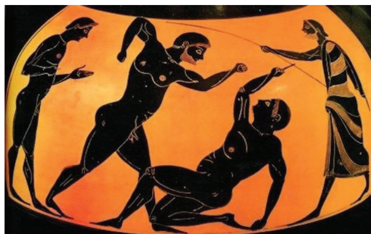
Figure 4. Depiction of ancient boxing on Greek Amphora (c. 332-331 B.C.E.)

to have been very bulky men in this sport (Upper 490 BC). The referee who is hitting the ‘big’ individual with his switch should he foul and the judge on the left announcing the win-