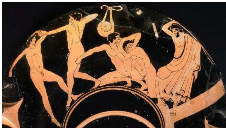
Figure 3. The ancient Pankration was denoted as the mixture of boxing and wrestling (490-80 B.C.E.)

A major draw was the ‘strong’ competitions at all Greek games - wrestling, boxing, and pankration. The pankration was a combination of boxing and wrestling that permitted virtually all techniques. This was wrong to just bit to head after an opponent’s pupils. In a terracotta cup (figure-3), a couple of boxers are in a fight to the left. A pair of pancratiasts is down on the field in the middle. A discus lies in a basket above them (Olympic Games | Ancient Greece, n.d.).