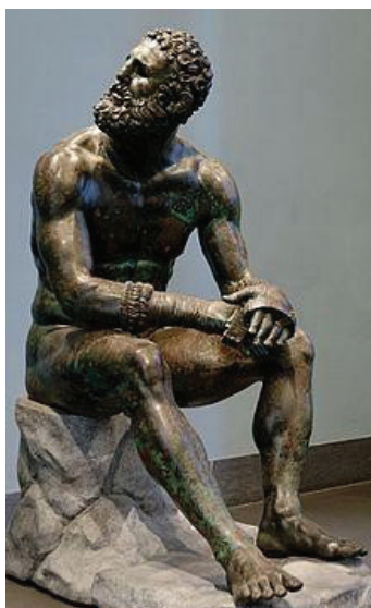
Figure 2. The Greek sculpture of a sitting nude boxer (c. 330 to 50 B.C.E., Hellenistic Kingdom)

The date of the statue, which is most likely between the late