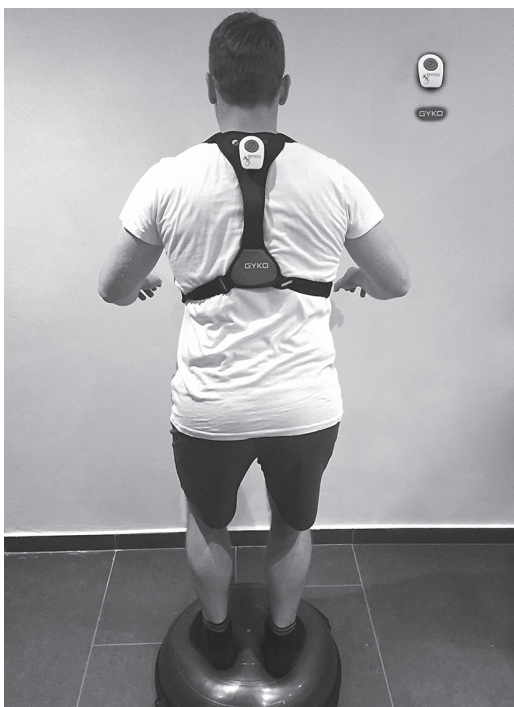
FIGURE 1 Participant during GYKO testing at BOSU balance trainer

All included participants were tested on two different balance tests assessing balance. The newly selected test for the evaluation of balance was performed on a BOSU balance trainer with a GYKO instrument attached to participants' backs (GYKO test), while a standard test evaluating balance (BAL40) was performed on a balance board during two-foot jumps. Tests were performed during the 2015 winter season after recreational skiers